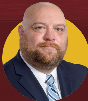
CLIENT INTAKE AND RELATIONS SPECIALIST